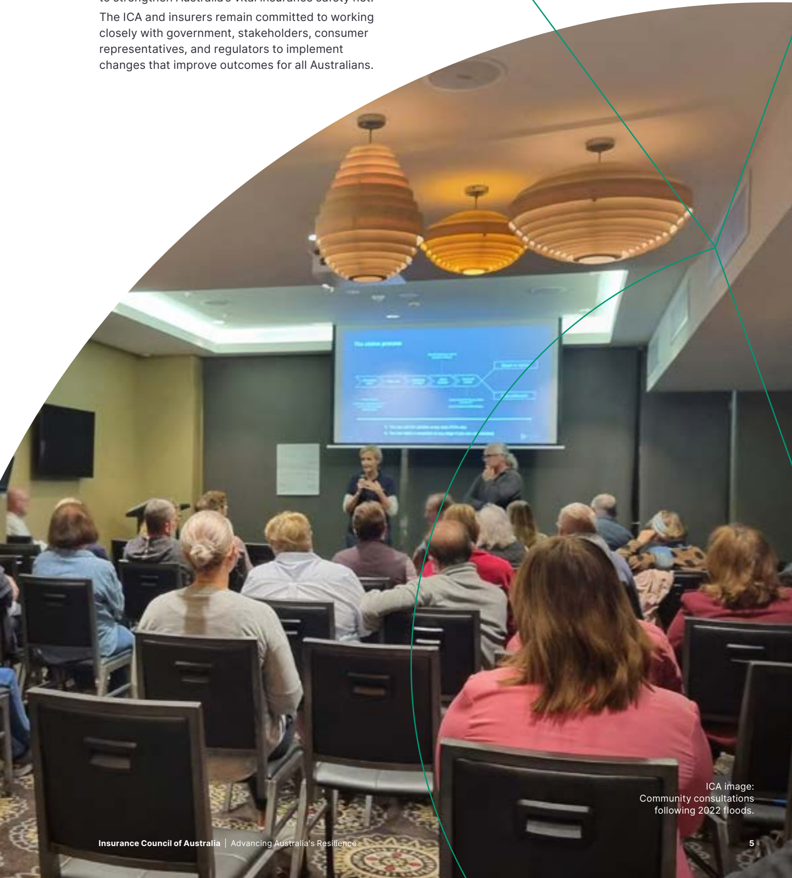
Community consultations following 2022 floods.

The ICA and insurers remain committed to working closely with government, stakeholders, consumer representatives, and regulators to implement changes that improve outcomes for all Australians.