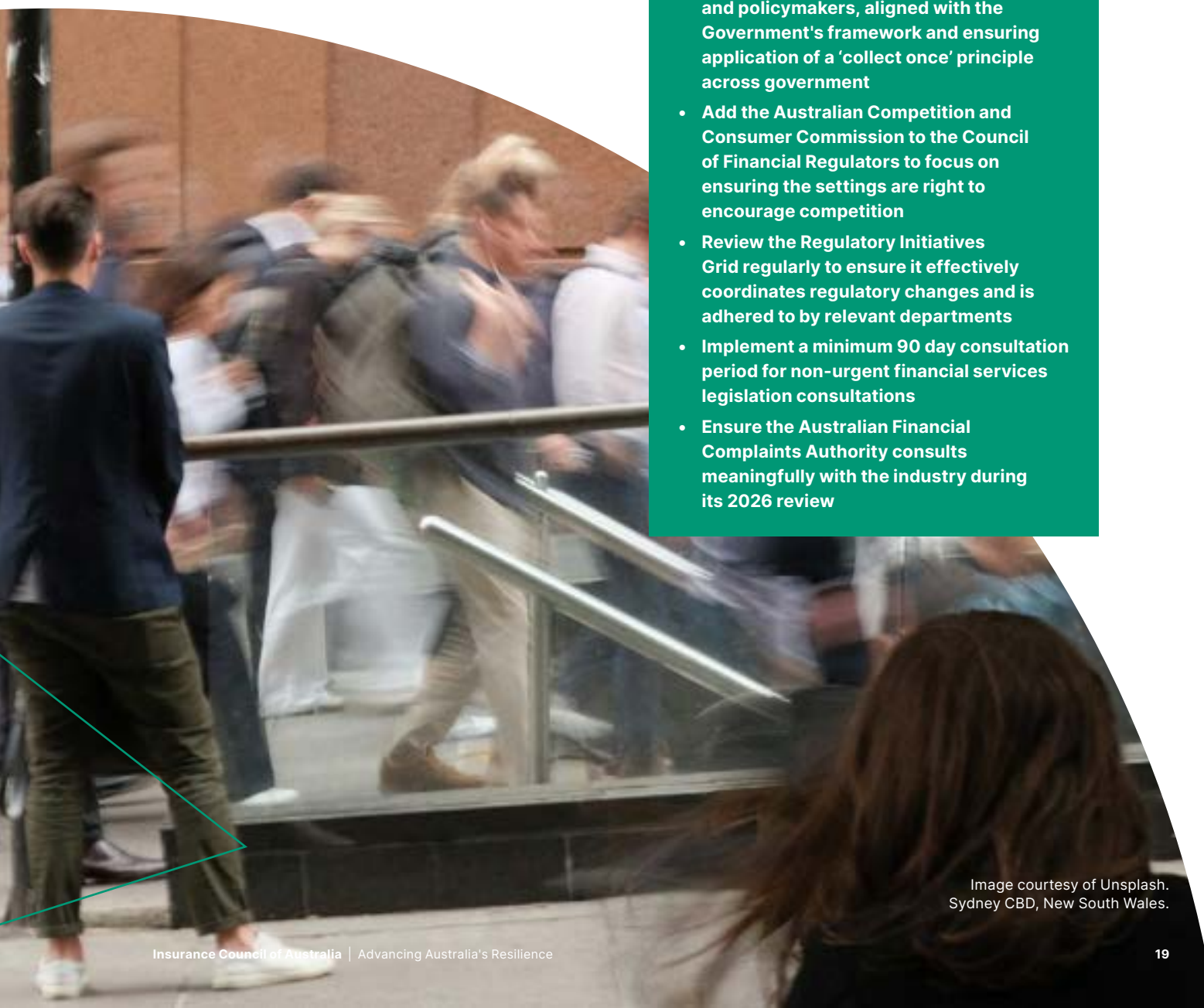
Sydney CBD, New South Wales.