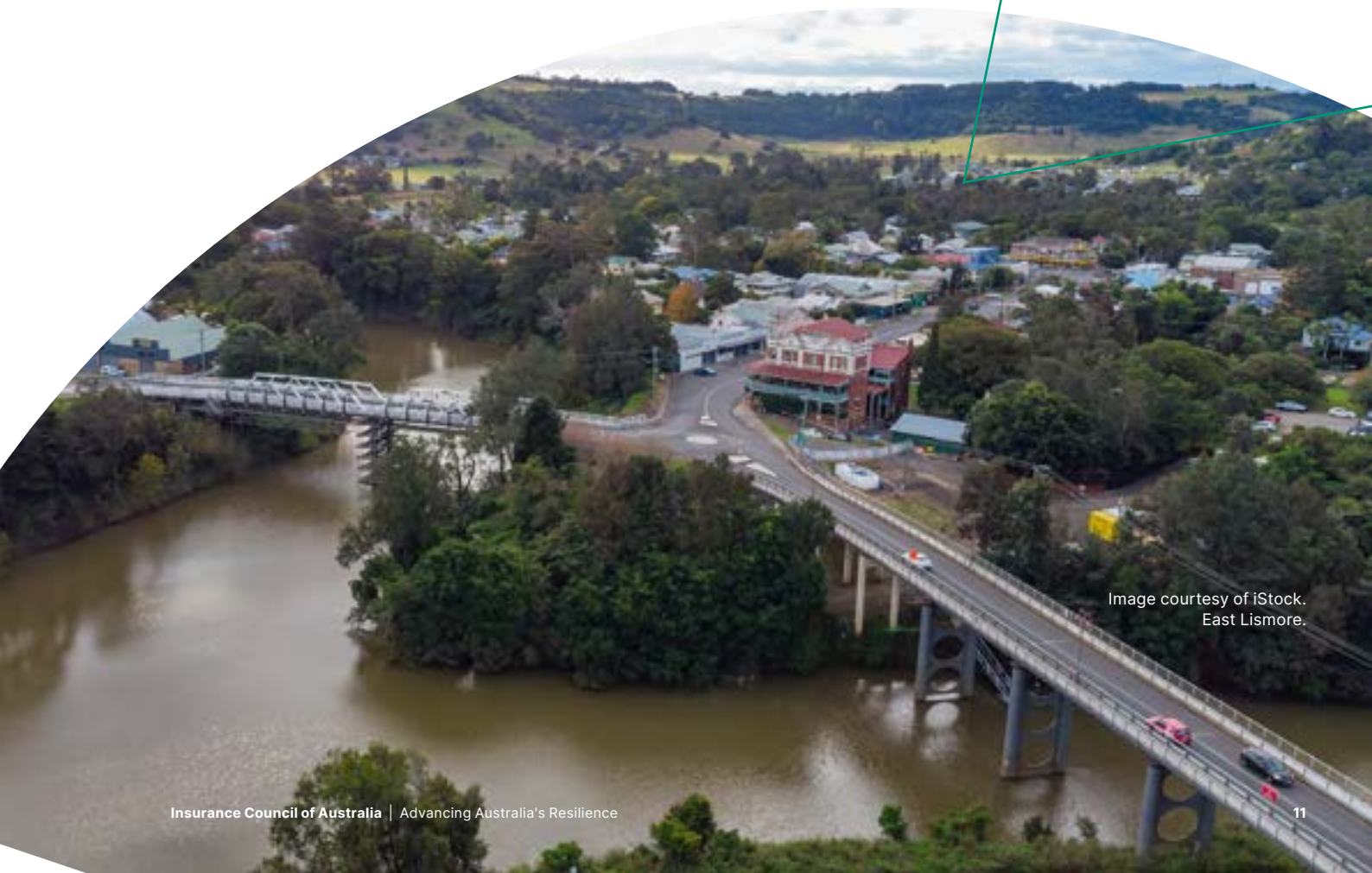
East Lismore.