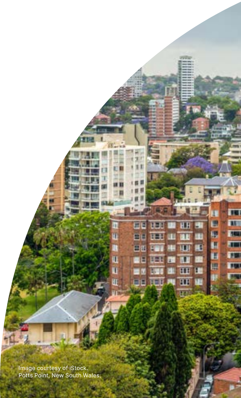
Potts Point, New South Wales.

Inflationary pressures on construction costs, poor land use planning, the effects of ageing housing stock, poor-quality design and construction, inadequate maintenance and rising lithium-ion battery fire risks have all significantly increased the risk of insuring strata complexes, impacting insurance premiums.