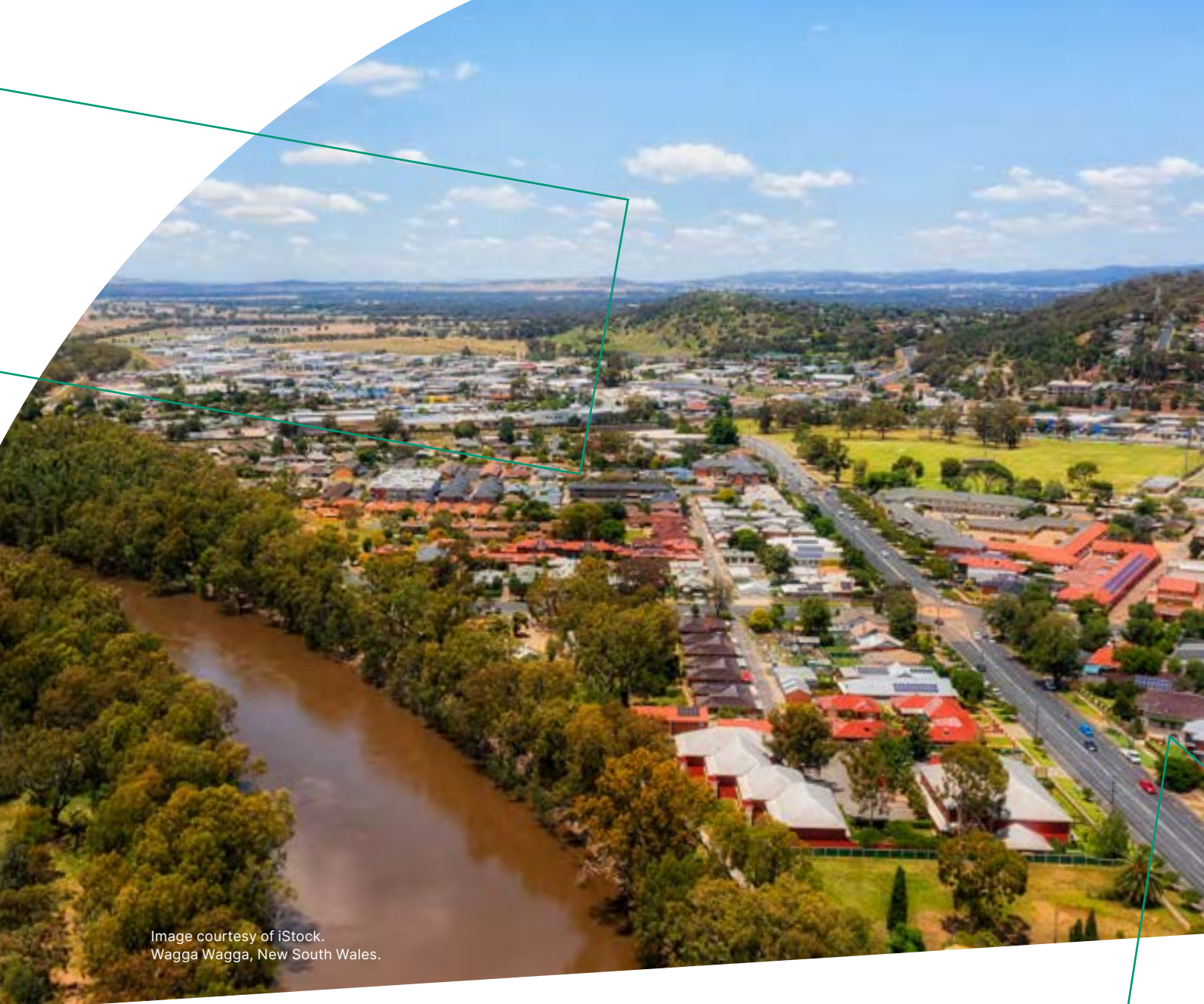
Wagga Wagga, New South Wales.