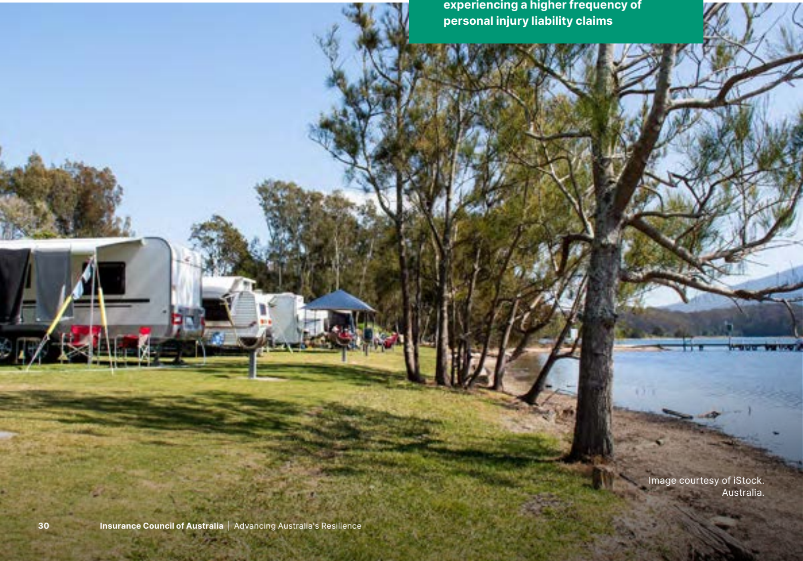
Australia.