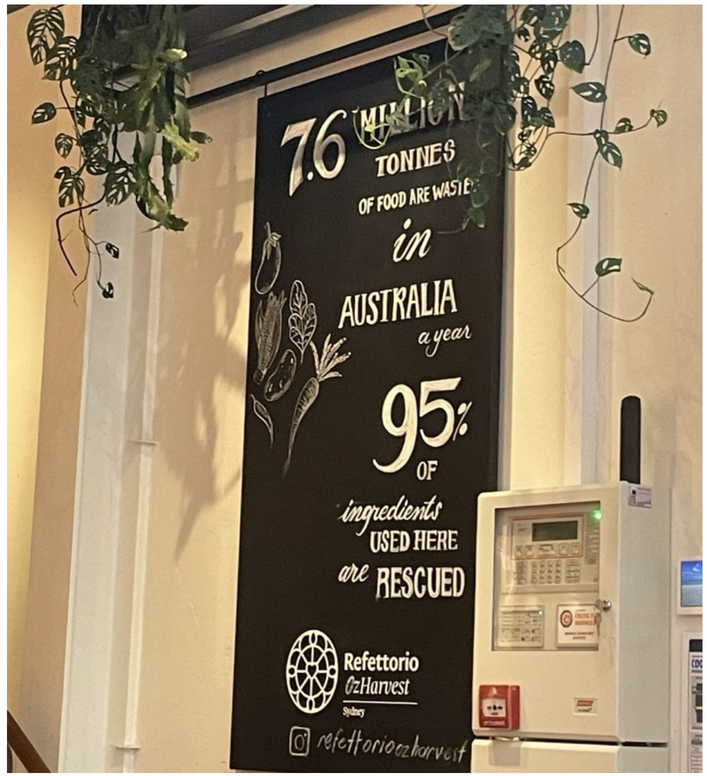
Figure 3: Food rescue statistics at Refettorio OzHarvest in Sydney.