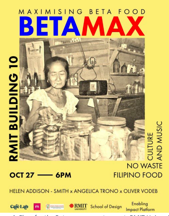
Figure 4: Flyer for the Betamax no waste event, RMIT University.