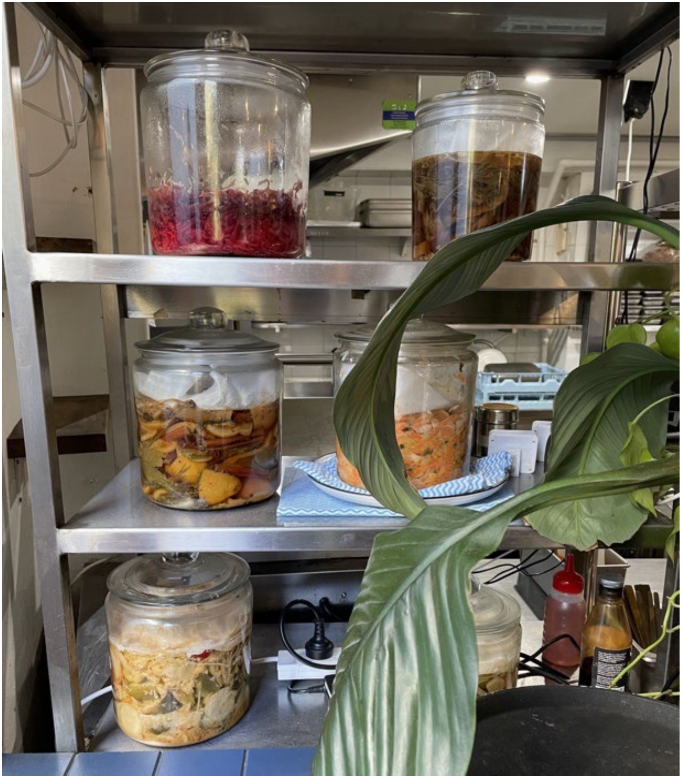
Figure 10: Ferments in action at Dad and the Frog Café, Sydney.