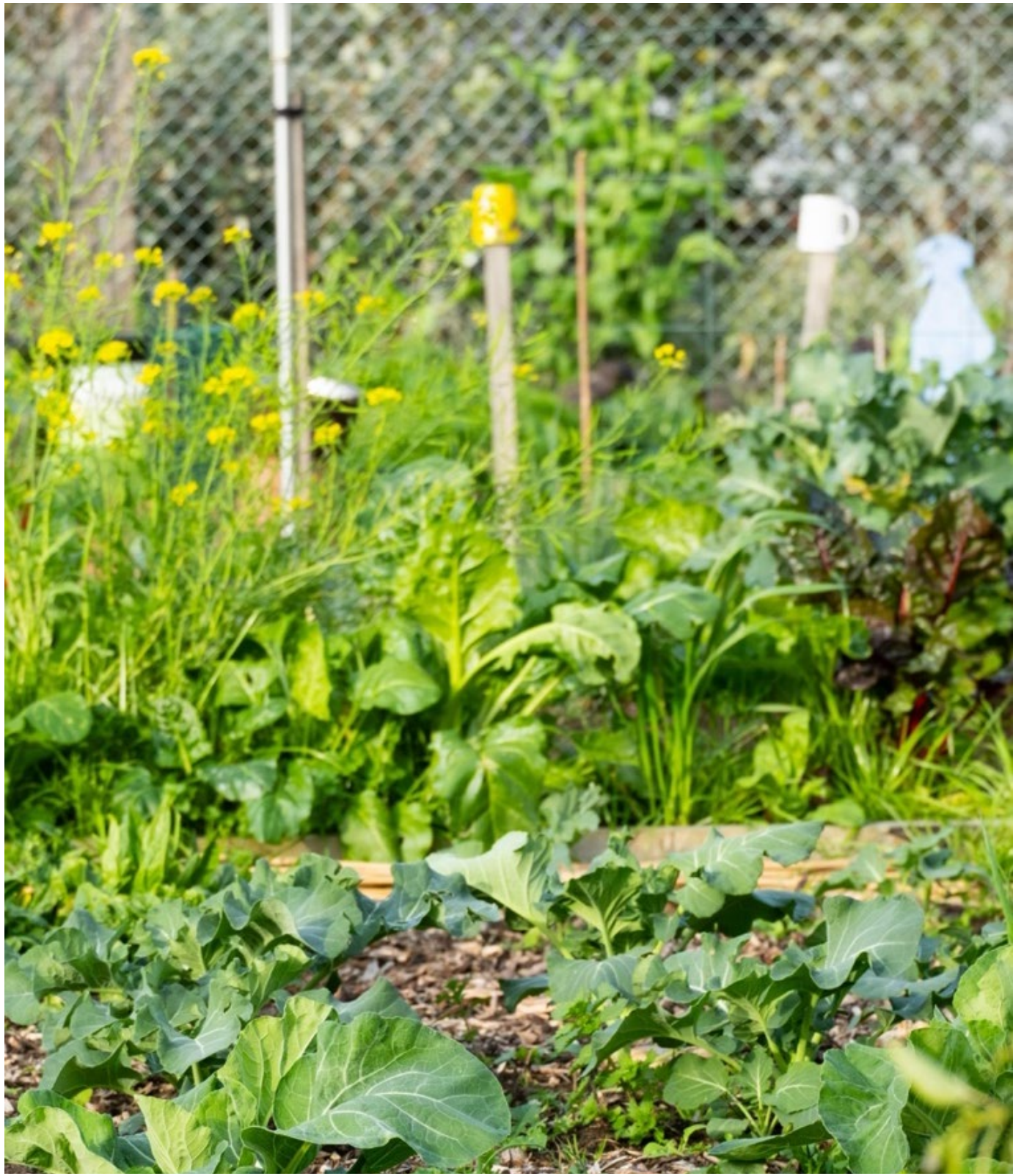
Figure 15: Vegetables growing at CERES, Melbourne.