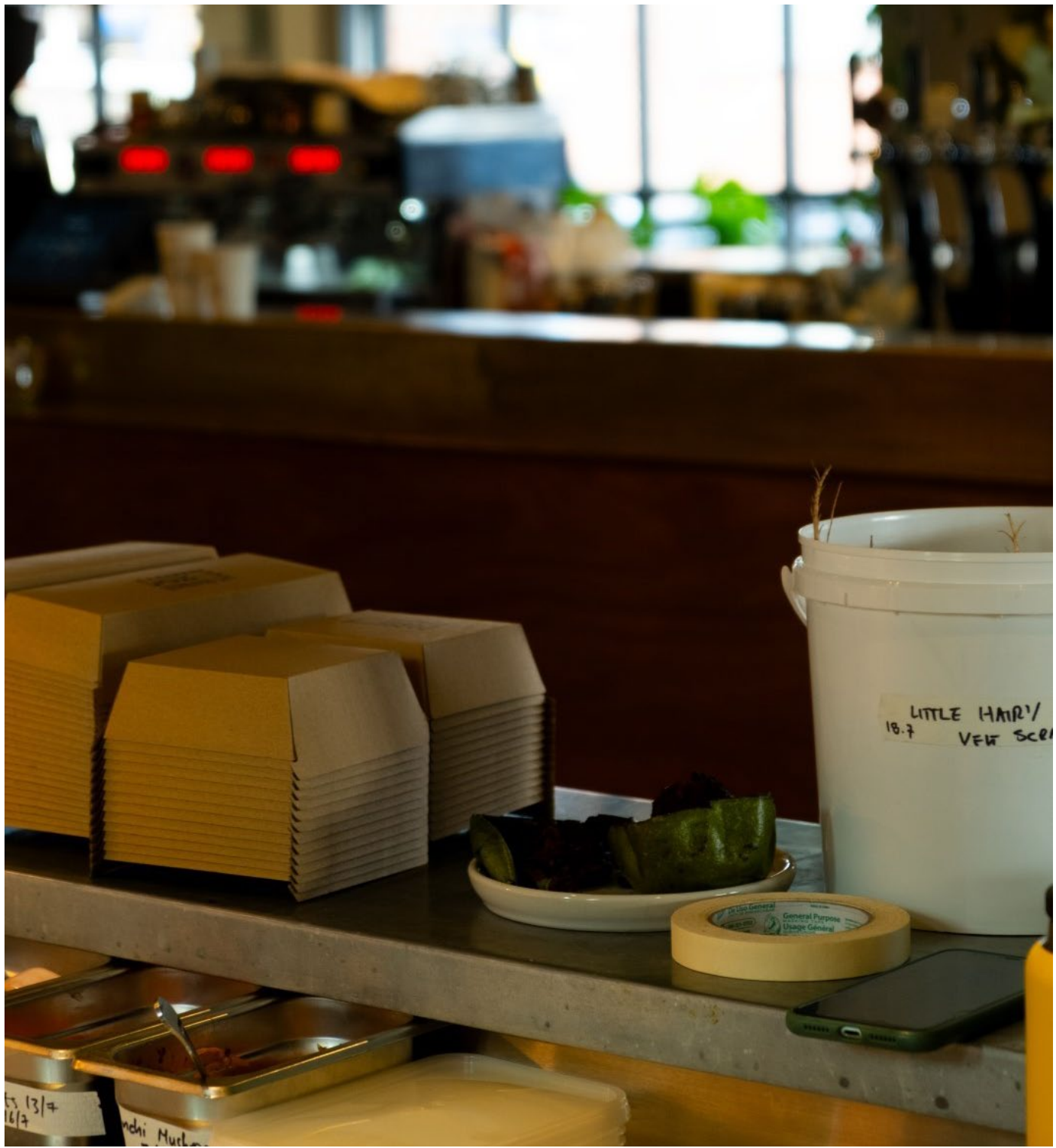
Figure 1: Cassette Café, Melbourne.