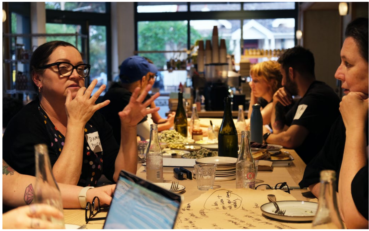
Figure 5: NSW industry workshop, Cornersmith.

Figure 4: Flyer for the Betamax no waste event, RMIT University.