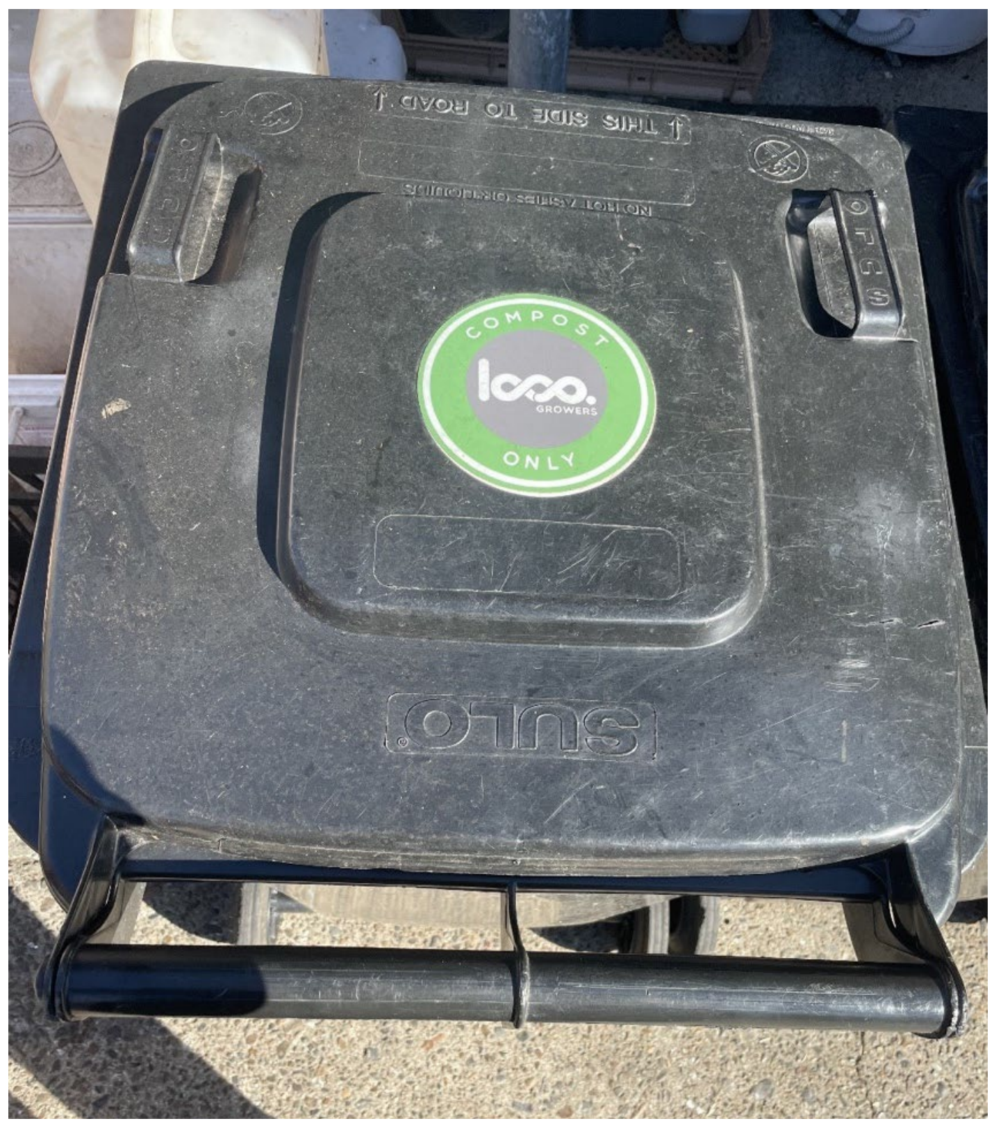
Figure 6: Food waste separation bin provided by Loop Farm (Brisbane) for its café partners.