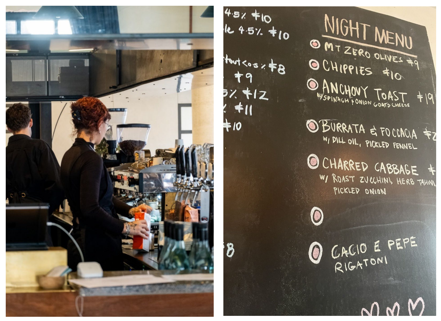
Figure 8: Barista at Cassette, Melbourne.

In-house training at the individual business level offers potential benefits across the sector. Knowledge and skills are shared across the industry in diverse ways and interacting with a diversity of communication channels can enable a more efficient transition to a low waste hospitality industry. For example, high staff turnover within the hospitality sector means skills developed in one kitchen can be passed on to another, creating a skill snowballing effect. Conversations between chefs in like-minded businesses also spread knowledge between older and younger generations of hospitality practitioners.