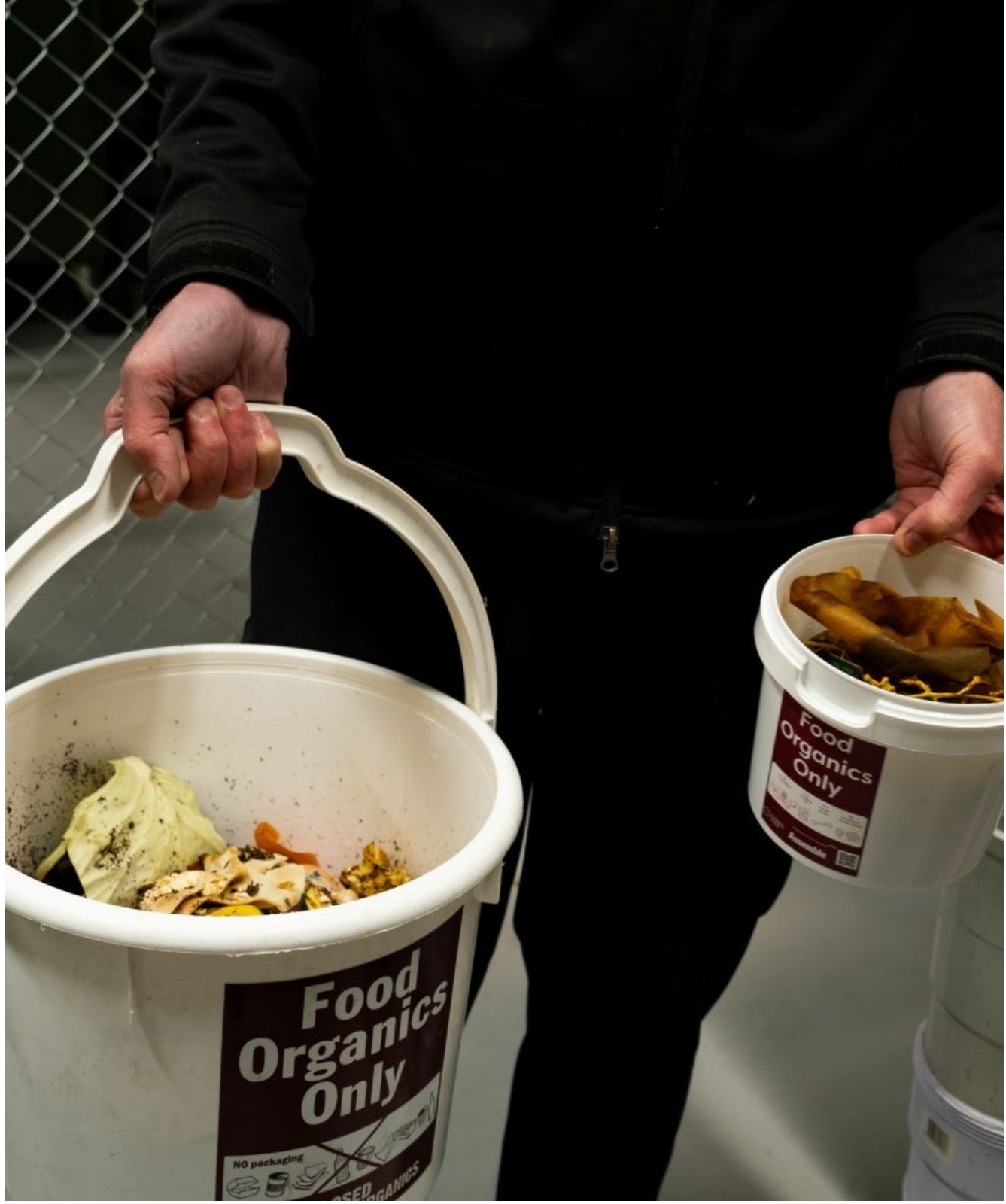
Figure 14: The bin room.